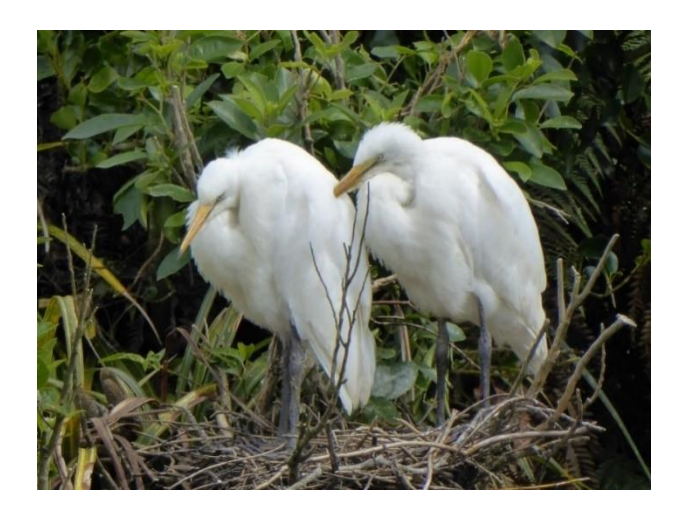
White Heron Juveniles on Nest at Waitangitaona River

The Te Reo group: There are some changes to the Te Reo Maori group. Unfortunately, we are not taking beginners this year but welcome anyone with some knowledge of Te Reo . As a group, we have progressed past the beginner stage, and want to advance our own learning and conversational skills. We have also changed our time and venue, now meeting every Tuesday afternoon from 1.30 to 3pm, in a private home. Anyone with some knowledge of Te Reo is welcome to join us to see whether our levels are compatible.